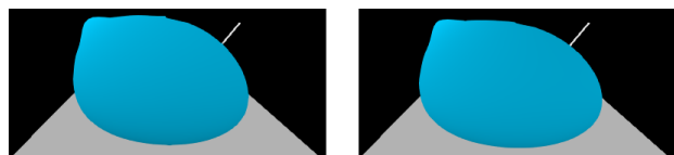
Figure 2: A BRDF lobe for 36.8° incident angle, computed using a standard DOM implementation (left) and using our method (right).

In the future, we would like to extend this model to take into account finite and multi-layered materials.